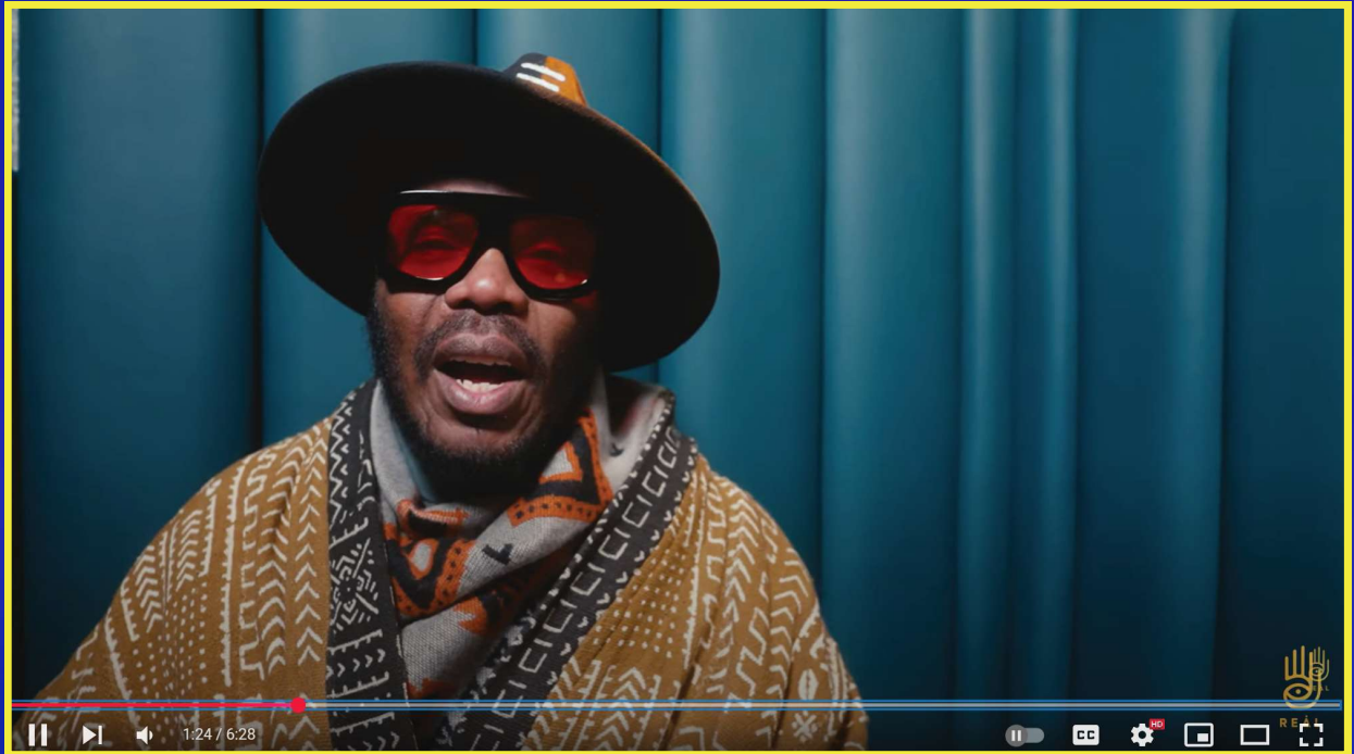
Can't Imagine - Promotional Video